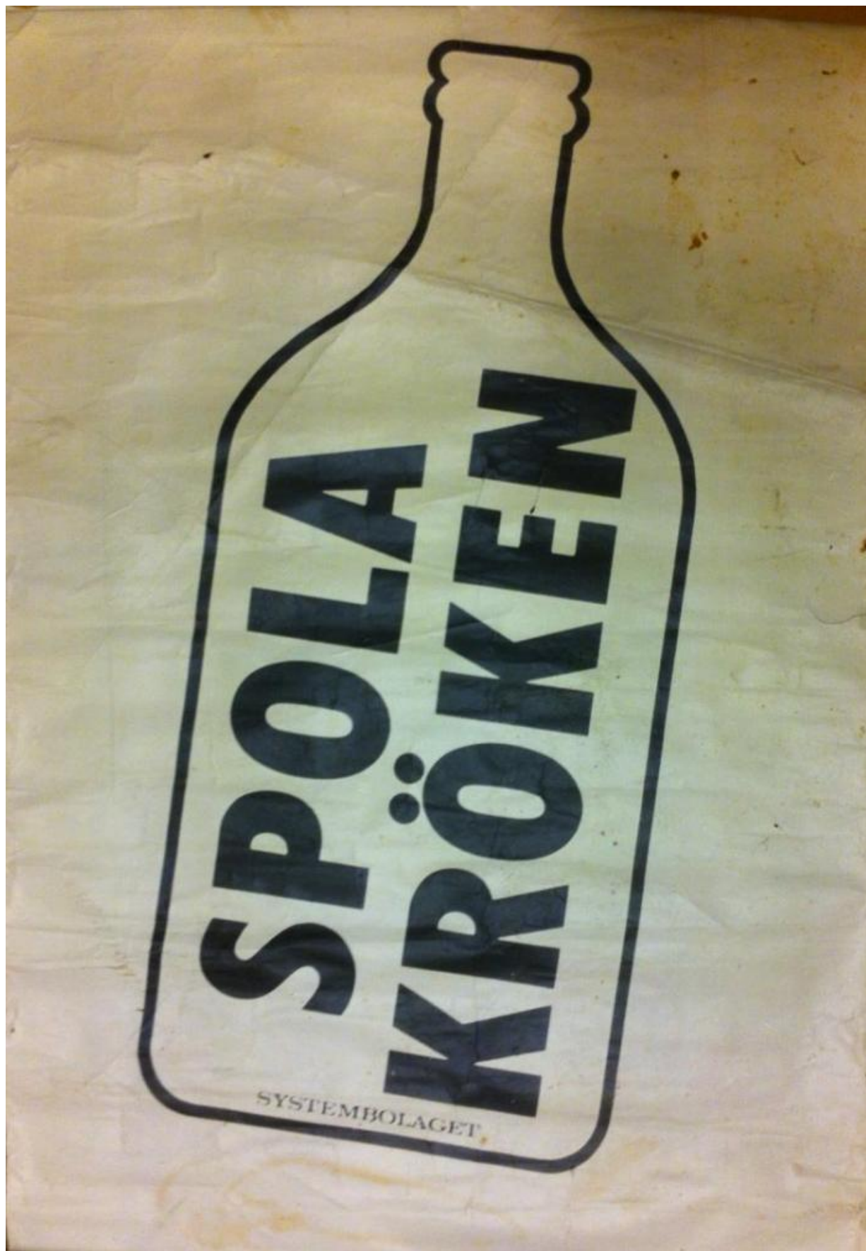
Fig. 1. Information poster issued by Systembolaget, mid-1970s. Copenhagen Fluxus Archive, National Gallery of Denmark.