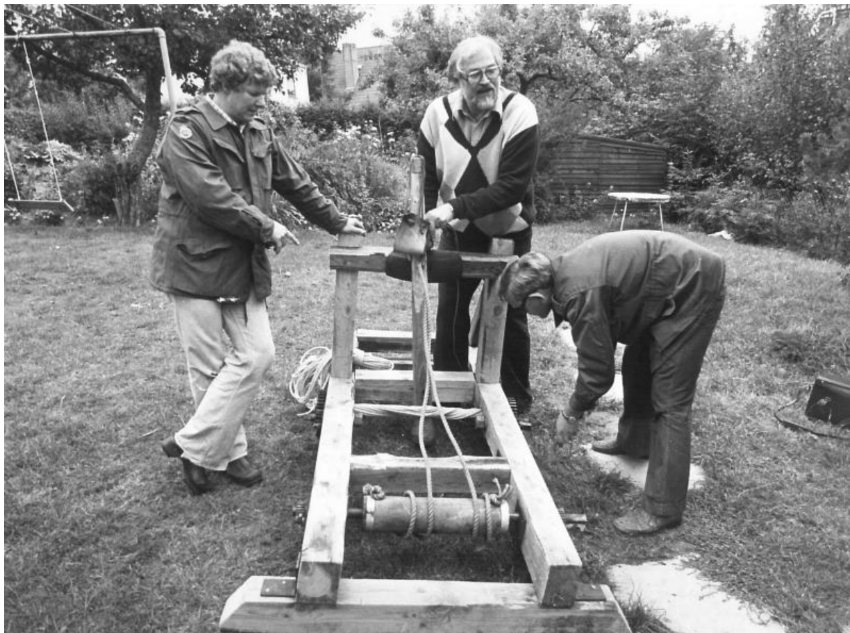
Fig. 4. Home Guard members demonstrating how the trebuchet works, 1976.