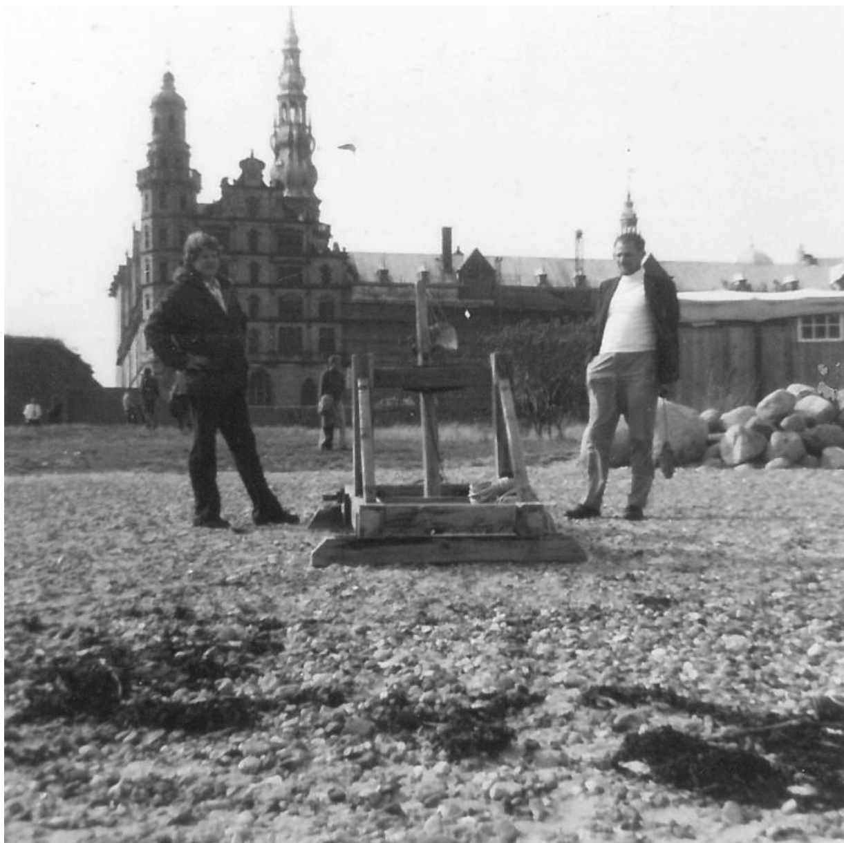
Fig. 5. The barrack and the trebuchet with Kronborg Castle in the background, 11 September 1976.

The acme of the project so far occurred on 11 September 1976 on the beach by Kronborg castle in Elsinore. On that day a temporary barrack is set up to host an auction of Systembolaget posters, and the trebuchet stands by the edge of the water. [fig. 5] Eric Andersen has devised an auctioning system where the posters are bid for in the form of 'units' purchased from a bar installed inside the barrack. All units must be purchased, and the highest bidder gets a poster with their purchase. On the beach the trebuchet is flanked by a wagonload of pine trees bearing Christmas ornaments; the wagon was driven down from Sweden by Jørgen Nash. Next to the trees is a sign saying "Et samfund i sprit, sorg og glæde" (A Society Soaked in Spirits, Sorrow and Joy). The choir of the temperance society (Nykterhetsförening) of Southern Sweden were also invited to attend and sing drinking songs, but nothing came of it. The bar, however, does a roaring trade. Bottles are emptied, those present write messages to Systembolaget and put them inside the bottles which are then sealed with sealing wax. A giro form is added to each bottle, enabling the recipient to pay the bottle deposit (30 øre). [figs. 6 and 7]