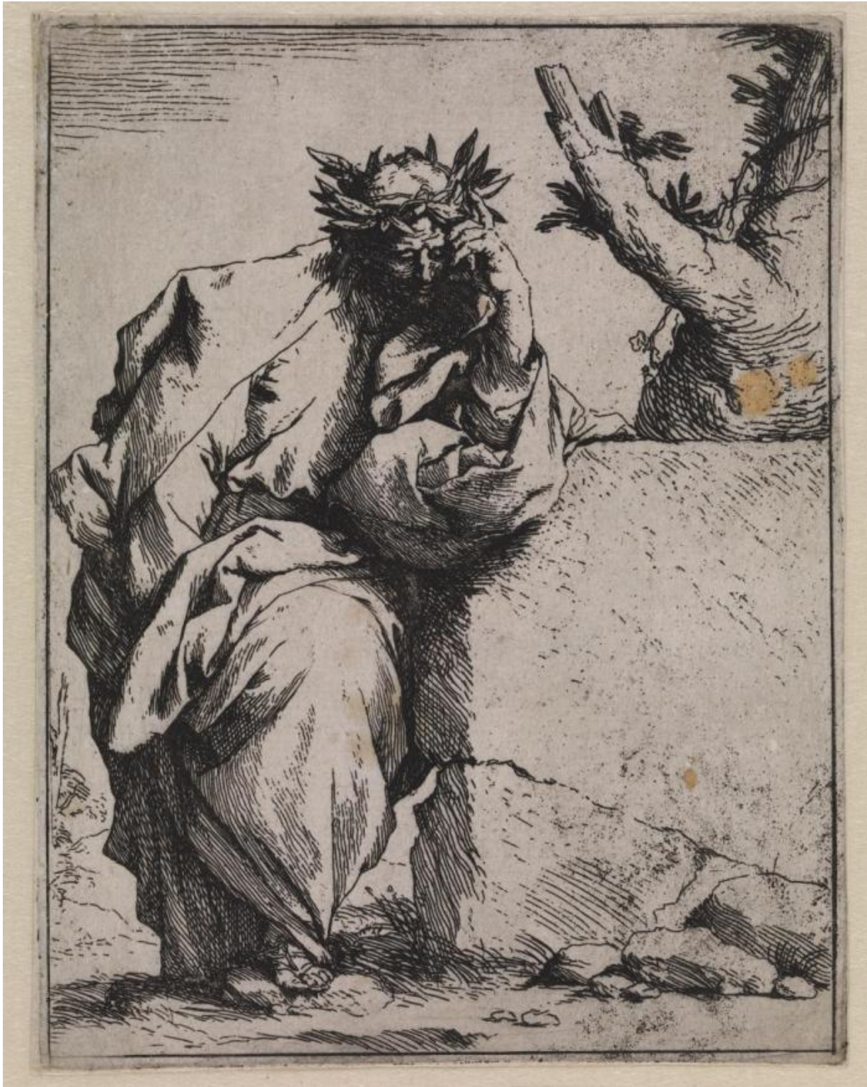
Fig. 16. Giuseppe Ribera (1591-1652): Le Poète. 1620-21. Etching. 160 x 125 mm (cropped, sheet measurements). The Royal Collection of Graphic Art, The National Gallery of Denmark, inv. no. KKSgb1083.