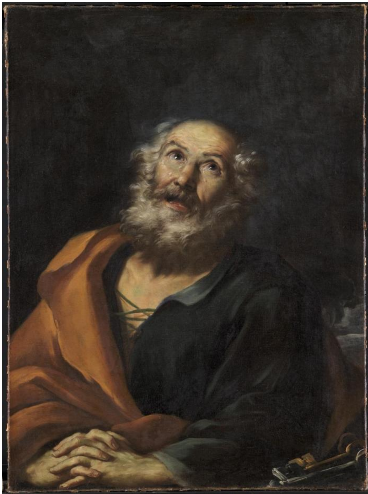
Fig. 4. Girolamo Troppa (1630 – after 1710): Saint Peter Penitent . Oil on canvas. 98 x 73 cm. The National Gallery of Denmark, inv. no. KMSst155.