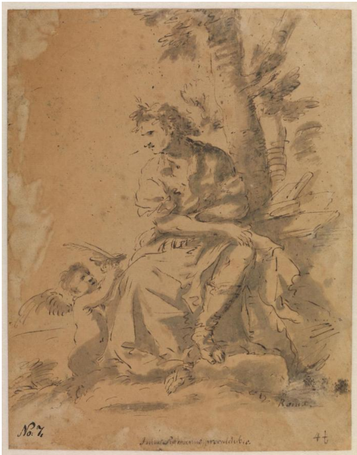
Fig. 17. Giuseppe Ribera, copy after A laurelled poet seated beneath a tree. Drawing in pen, brown ink and greyish brown wash. 256 x 201 mm. The Royal Collection of Graphic Art, The National Gallery of Denmark, inv. no. KKSgb7069