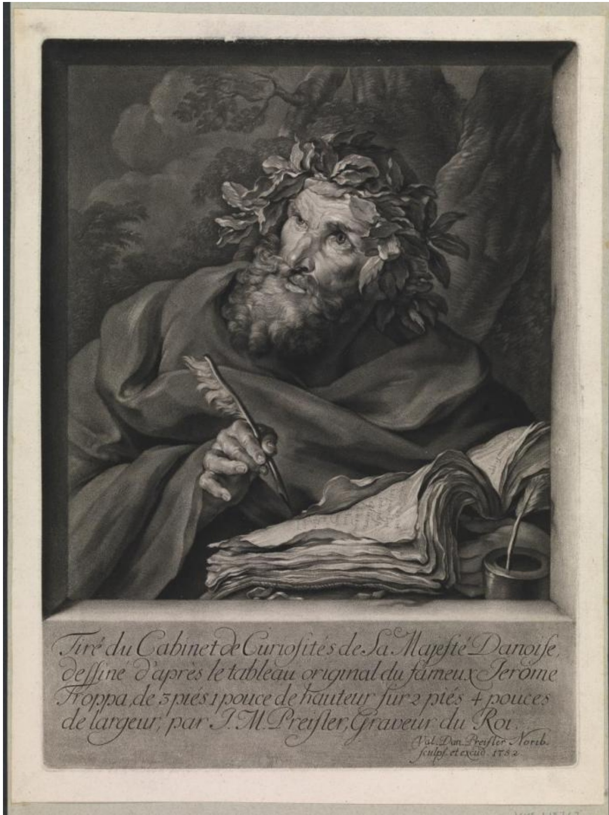
Fig. 7. Valentin Daniel Preisler (1717–65) after Girolamo Troppa: Vergil . Mezzotint. 390 x 286 mm (plate size). The Royal Collection of Graphic Art, The National Gallery of Denmark, inv. no. KKSgb13767.