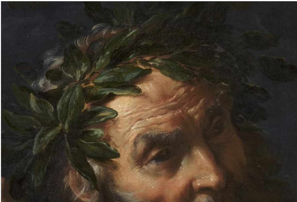
Fig. 10. Girolamo Troppa (1630 – after 1710): Homer, detail of fig. 2. Troppa uses opaque layers and just a few tones of green in the wreath of leaves. The few highlights seen in the leaves have been applied in yellow, forming an impasto rim along the edge of the leaf. The wispy white hair on the scalp leaves the brown ground exposed, causing it to act as the shadow colour.

Troppa's 'Four Philosophers' are characterised by a restricted, harmonious palette comprising only a few colours. They also display a markedly sculptural approach to the draperies, one in which the individual folds accentuate the rhythm of the composition. Troppa was clearly partly bound by the iconography of the era as far as the colours of the garments are concerned. Having said that, it is striking to notice how each painting has its own harmonious palette even as the paintings taken as a whole display a sophisticated colourism in which the blue-black sky with the moonlit clouds establishes a common underlying motif. Similarly, the reddish-brown ground common to all four paintings also contributes to the sense of an overall unity. [fig. 10] This general impression is strengthened by the local colour of the voluminous robes worn by the four figures: these colours share the same degree of saturation and tonal intensity, which also serves to connect and unite the series. Troppa seems to be oriented towards the particular mode of colour which the art theory literature of the age calls unione - a harmonious unity of tone and colour, a fusion of all the component parts of the picture to form a congruent whole that still offers scope for those contrasts of light and shadow required by space-defining chiaroscuro . 21 [fig. 11-13]