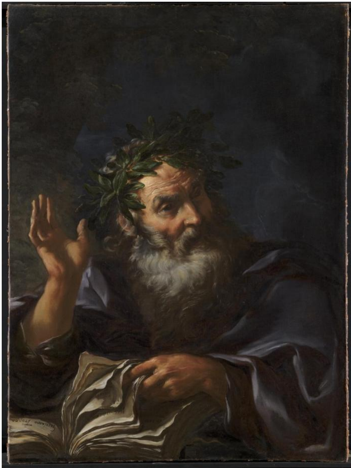
Fig. 2. Girolamo Troppa (1630 – after 1710): Homer . Oil on canvas. 98 x 73 cm. The National Gallery of Denmark, inv. no. KMSst139.