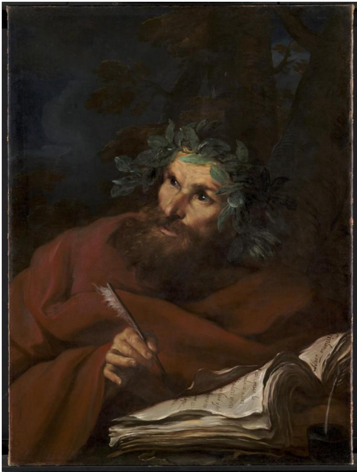
Fig. 1. Girolamo Troppa (1630 – after 1710): Virgil . Oil on canvas. 98 x 73 cm. The National Gallery of Denmark, inv. no. KMSst153. public domain, SMK.