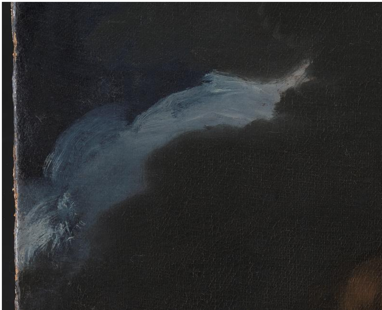
Fig. 13. Girolamo Troppa (1630 – after 1710): Saint John the Baptist, detail of fig. 3. The white, moonlit cloud seen in the dark sky has been painted with lightning speed using just a few broad brushstrokes. At the very edge of the picture the artist has pushed and poked his brush into the canvas so that he did not create brushstrokes as such, but a splayed, mottled effect. According to conservator Loa Ludvigsen, the National Gallery of Denmark, the blue colour is in fact a black colour that turns black-blue when mixed with white.

Troppa has scratched guide lines onto the page of the book while the white paint was still wet. Perhaps he turned his brush around, using the tip of its handle to scratch the paint. Once the white paint had dried he painted text onto the guide lines.