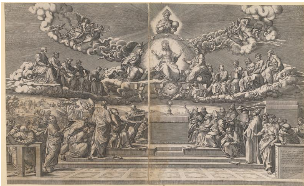
Fig. 15. Giorgio Ghisi (1520-1582) after Raphael: La Disputa. Etching. 525 x ca. 847 mm (sheet measurement, two parts). The Royal Collection of Graphic Art, The National Gallery of Denmark, inv. no. KKSgb13770.

attention is Apollo surrounded by the muses. Where Homer and Virgil are representatives of Poetry, the penitent Saint Peter and Saint John the Baptist represent Theology. In Raphael's La Disputa Saint Peter holds a prominent position in Heaven, where he is the first in the row of disciples. [fig. 15] Saint John the Baptist flanks the haloed Christ with the Virgin on the other side.