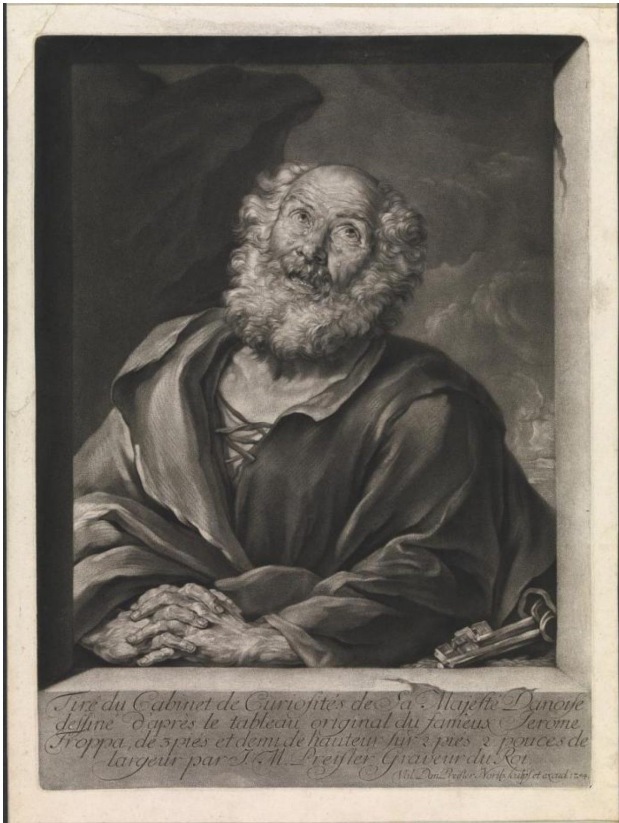
Fig. 6. Valentin Daniel Preisler (1717–65) after Girolamo Troppa: Saint Peter Penitent . Mezzotint. 395 x 290 mm (plate size). The Royal Collection of Graphic Art, The National Gallery of Denmark, inv. no. KKSgb13766.