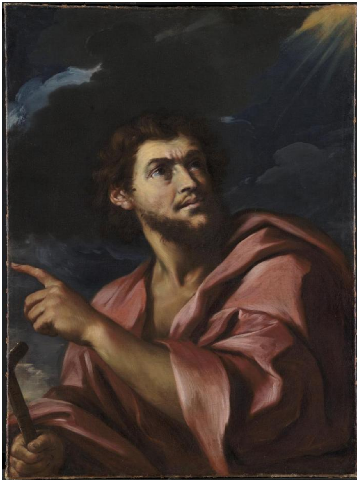
Fig. 3. Girolamo Troppa (1630 – after 1710): Saint John the Baptist . Oil on canvas. 98 x 73 cm. The National Gallery of Denmark, inv. no. KMS141. public domain, SMK.