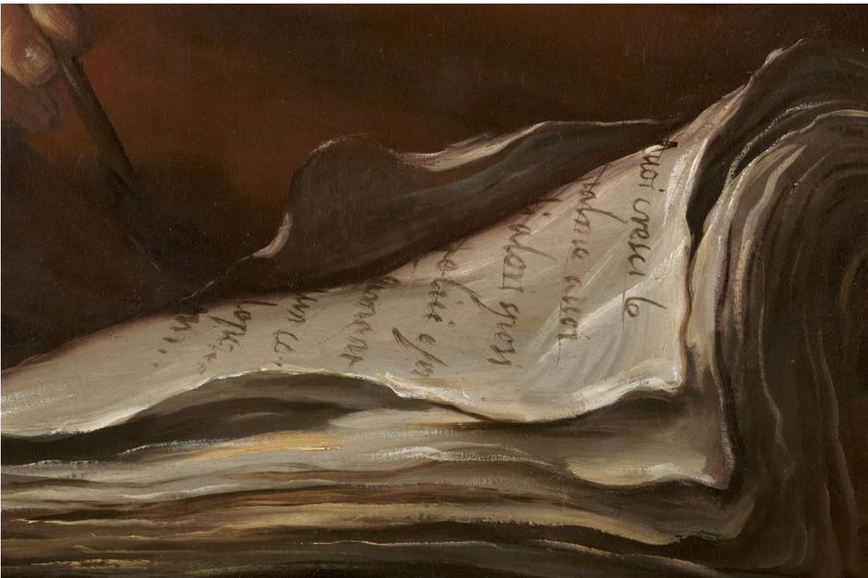
Fig. 12. Girolamo Troppa (1630 – after 1710): Virgil, detail of fig. 1.