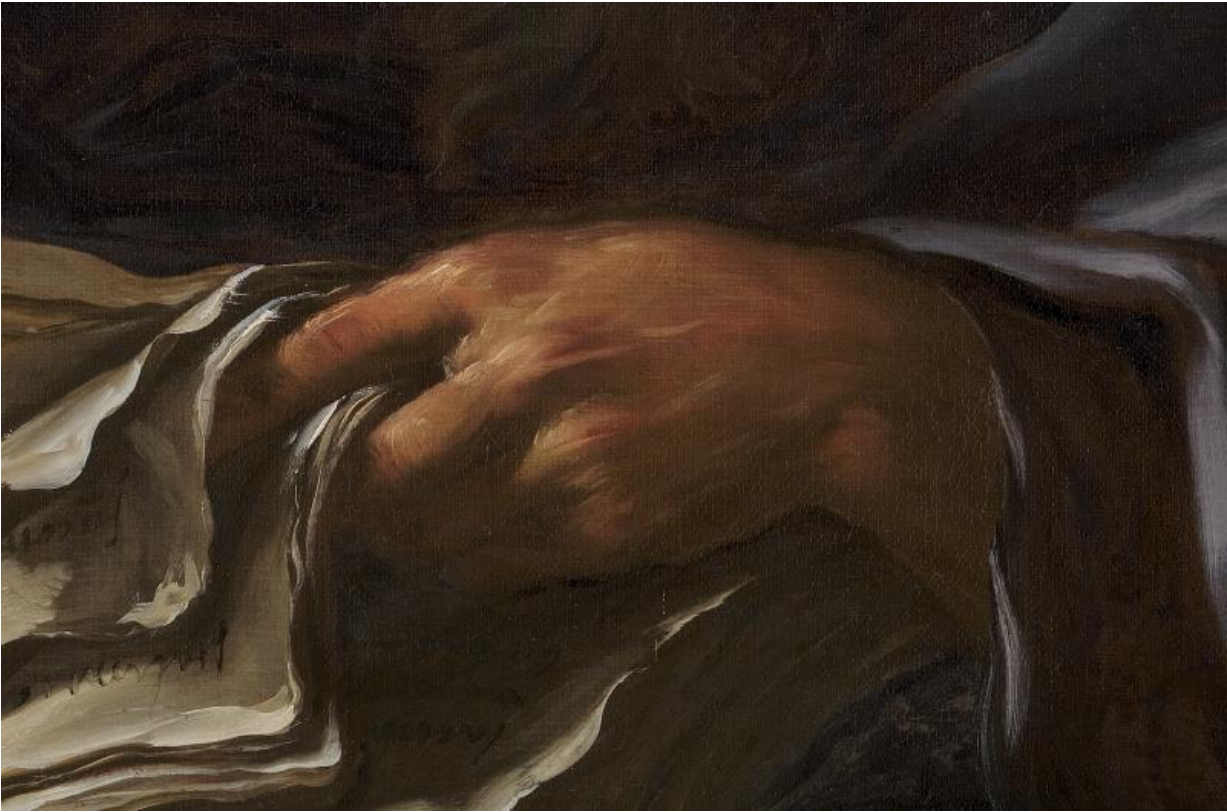
Fig. 11. Girolamo Troppa (1630 – after 1710): Homer, detail of fig. 2. The impasto highlights on the leaves of the book have been applied along their edges; Troppa has accidentally brushed across the paint before it dried. The summary manner of painting is evident in the way in which the artist has used broad brushes to apply just a few brushstrokes in the shaded areas of the leaves.