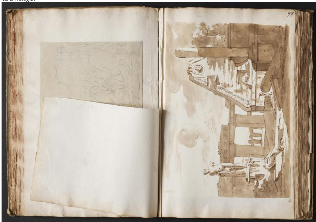
Fig. 10. Johan Mandelberg: Album containing 187 drawings, mostly after the antique. The Royal Collection of Graphic Art (on permanent loan from the Danish National Art Library). Purchased for the Royal Danish Academy of Fine Arts at the estate sale of Johan Bülow in 1829. To the left, the verso of sheet 94 featuring one of the drawings that must have been added by Bülow. When the album was divided up between the Academy and J.C. Spengler, the top of sheet 95 and sheets 96-97 were cut out and the drawings on them added to the