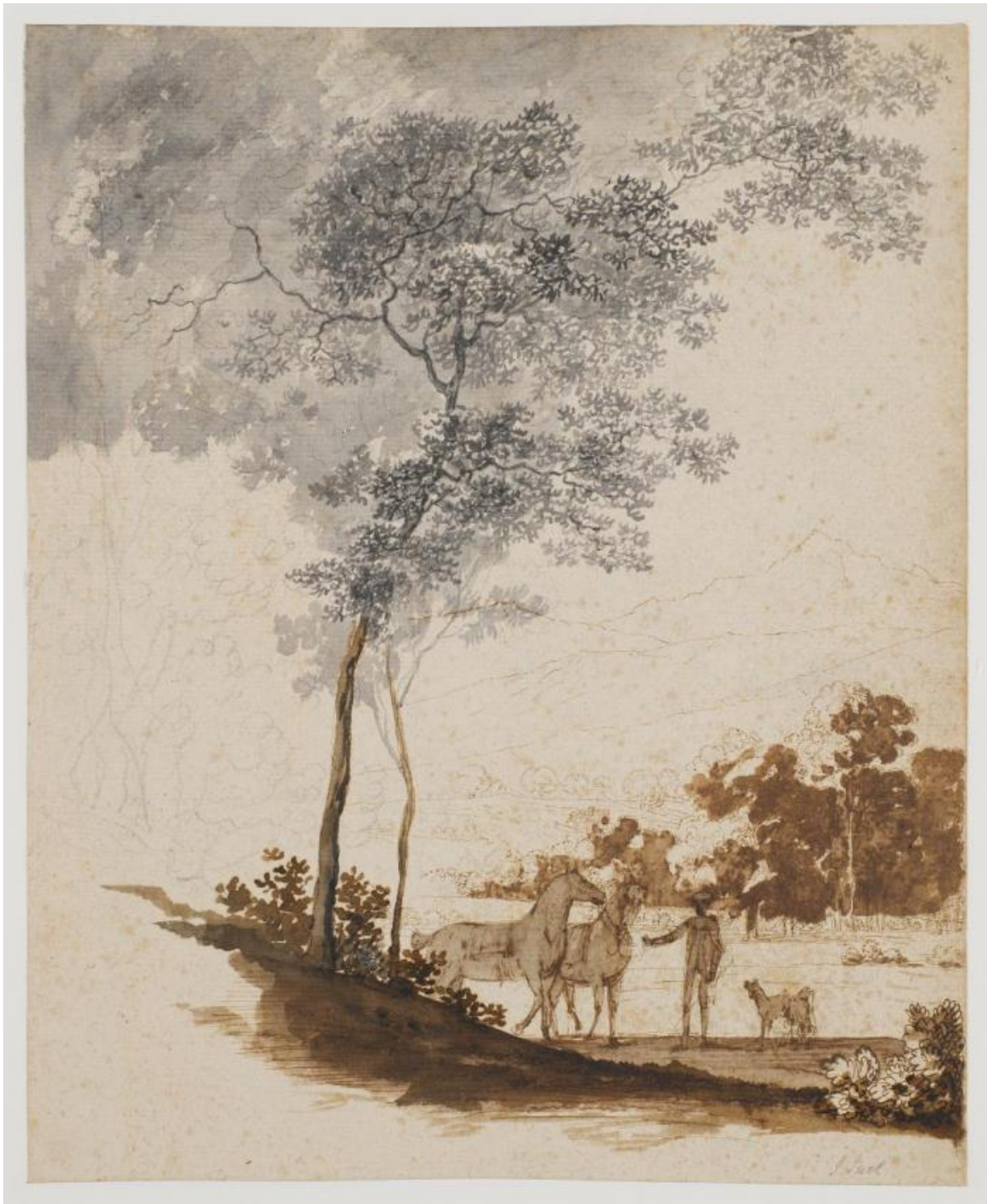
Fig. 9. Jens Juel: Swiss landscape with a groom holding two horses and a brace of dogs; study for a portrait of Jean-Armand Tronchin . Circa 1779. Black chalk, pen and ink and Indian ink wash on grounded paper. 347 x 285 mm. The Royal Collection of Graphic Art, KKSgb5356. Acquired as part of J.C. Spengler's collection in 1840.