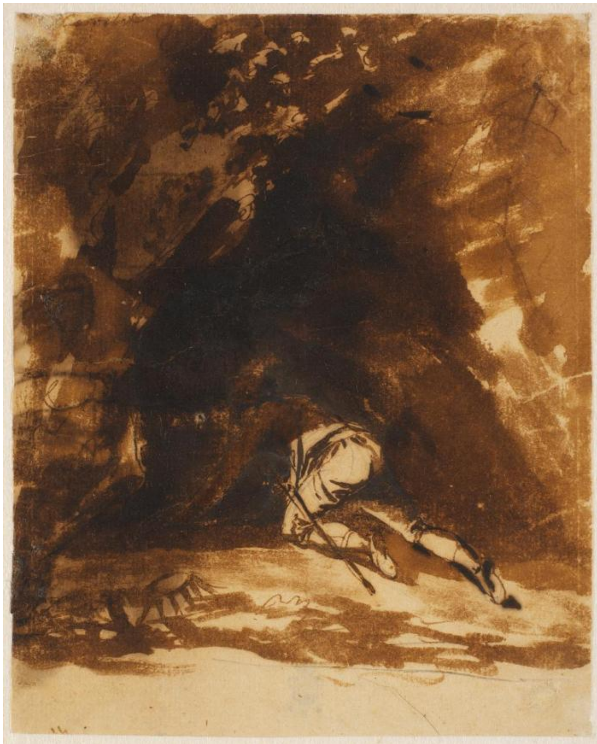
Fig. 3. N.A. Abildgaard: Niels Klim entering the cave . Circa 1788. Pencil, pen, ink and wash. 195 x 156 mm. The Royal Collection of Graphic Art, KKSgb3704. Bought for the Royal Danish Academy of Fine Arts at the estate sale of J.F. Clemens in 1832; transferred to The Royal Collection of Graphic Art in 1845. Statens Museum for Kunst, public domain , SMK .

In the meantime Christian Jürgensen Thomsen had submitted the requested memorandum. In this document he advised against leaving the systematisation and expansion of the collections to the Royal Danish Academy of Fine Arts. 20 Instead he suggested that all of the royal collections of drawings and prints should be combined in an autonomous institution - a model that reflected Thomsen's visionary endeavours to make the royal collections accessible as a range of specialised