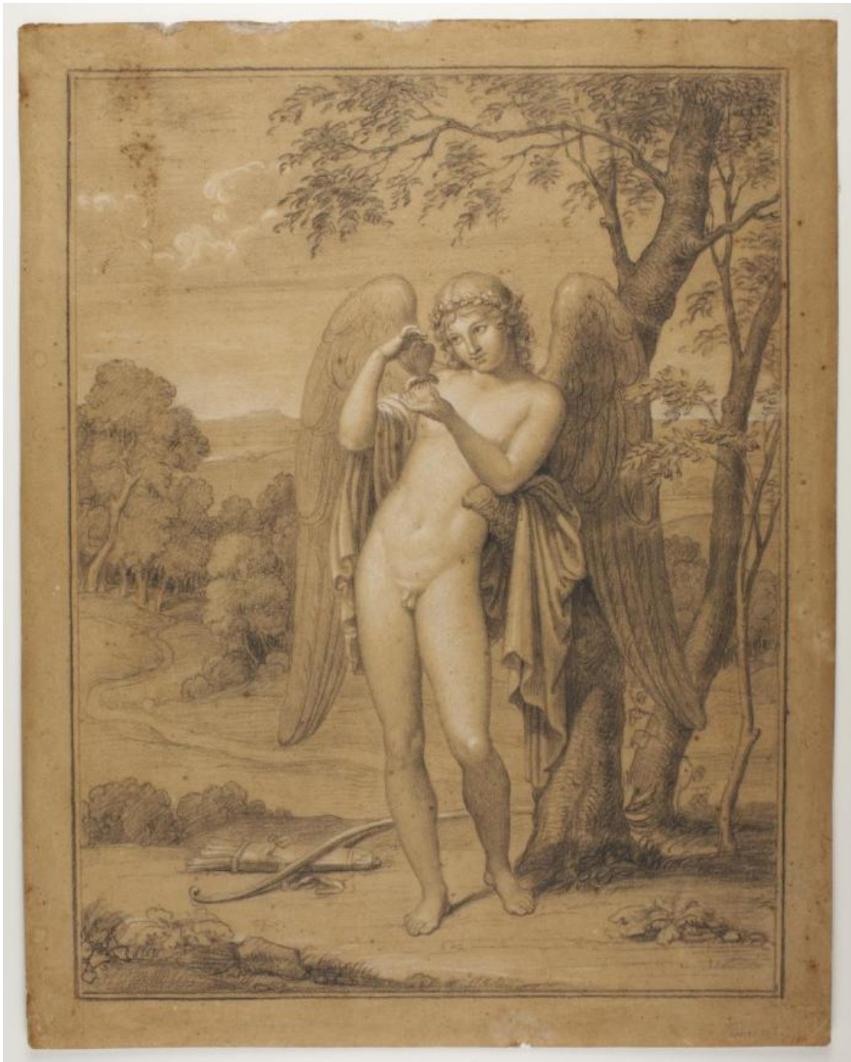
Fig. 13. Bertel Thorvaldsen: Cupid playing with a butterfly . Circa 1805–10. Black charcoal with white highlights on light brown paper. 421 x 333 mm. The Royal Collection of Graphic Art, on permanent loan to Thorvaldsens Museum, Dep. 7. Purchased by J.C. Spengler at the estate sale of Johan Bülow in 1829; received as part of Spengler's collection 1840.

While the Royal Danish Academy of Fine Art's early overtures towards establishing a public collection of Danish drawings was soon consigned to oblivion, the Royal Collection of Graphic Art had, by the early 1840s, completely taken over as the primary public collection of Danish drawings. Among artists, it soon became natural to think that their sketches and studies might be of national significance and institutional interest. So when Johan Thomas Lundbye pondered the matter of his