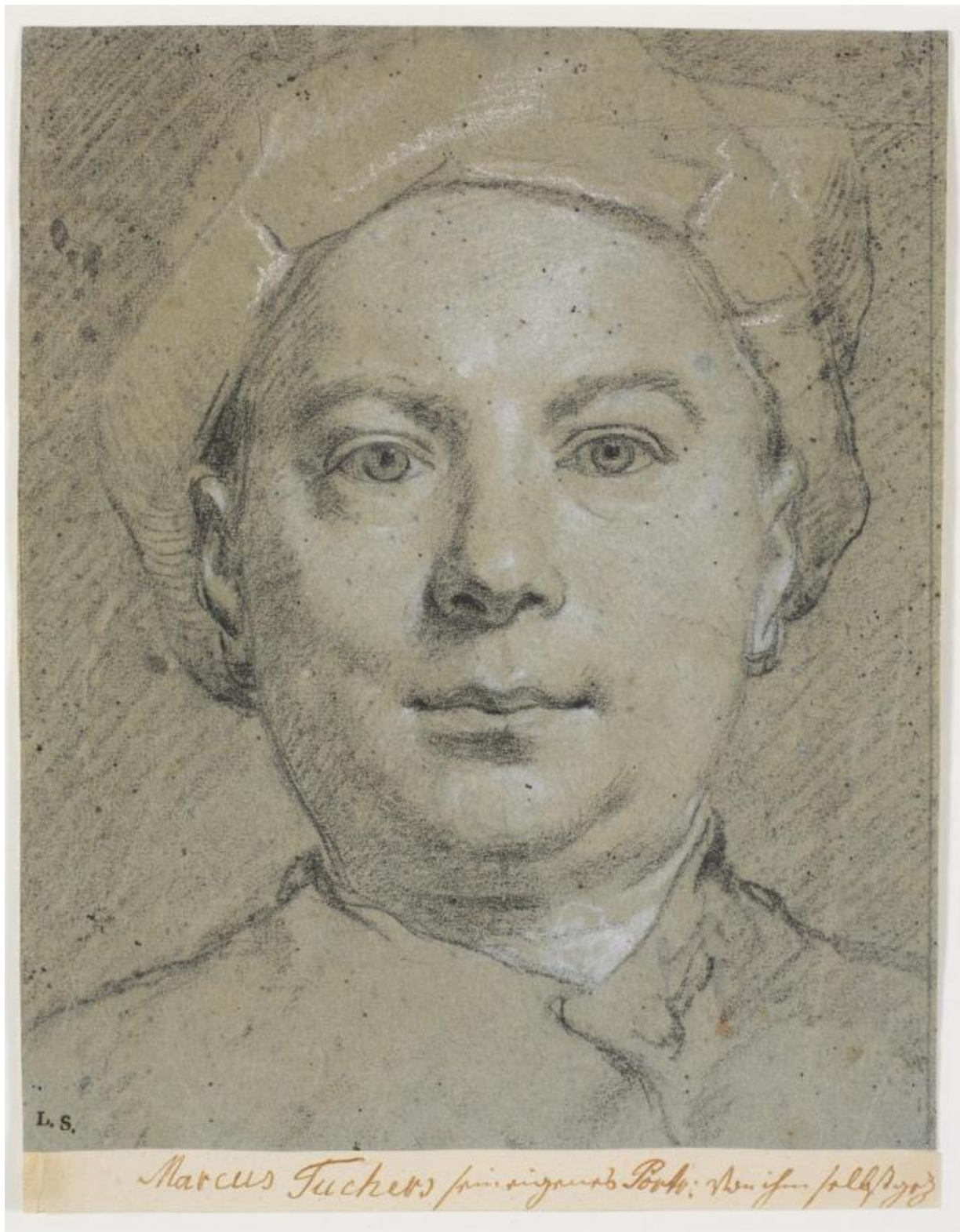
Fig. 5. Marcus Tucher: Self-portrait . Circa 1740s. Black and white chalk on greyish-green paper. 266 x 216 mm. The Royal Collection of Graphic Art, KKSgb6375. Bought by Frederik VI as part of Lorenz Spengler's collection in 1810; transferred to the Royal Collection of Graphic Art at its inception in 1835.