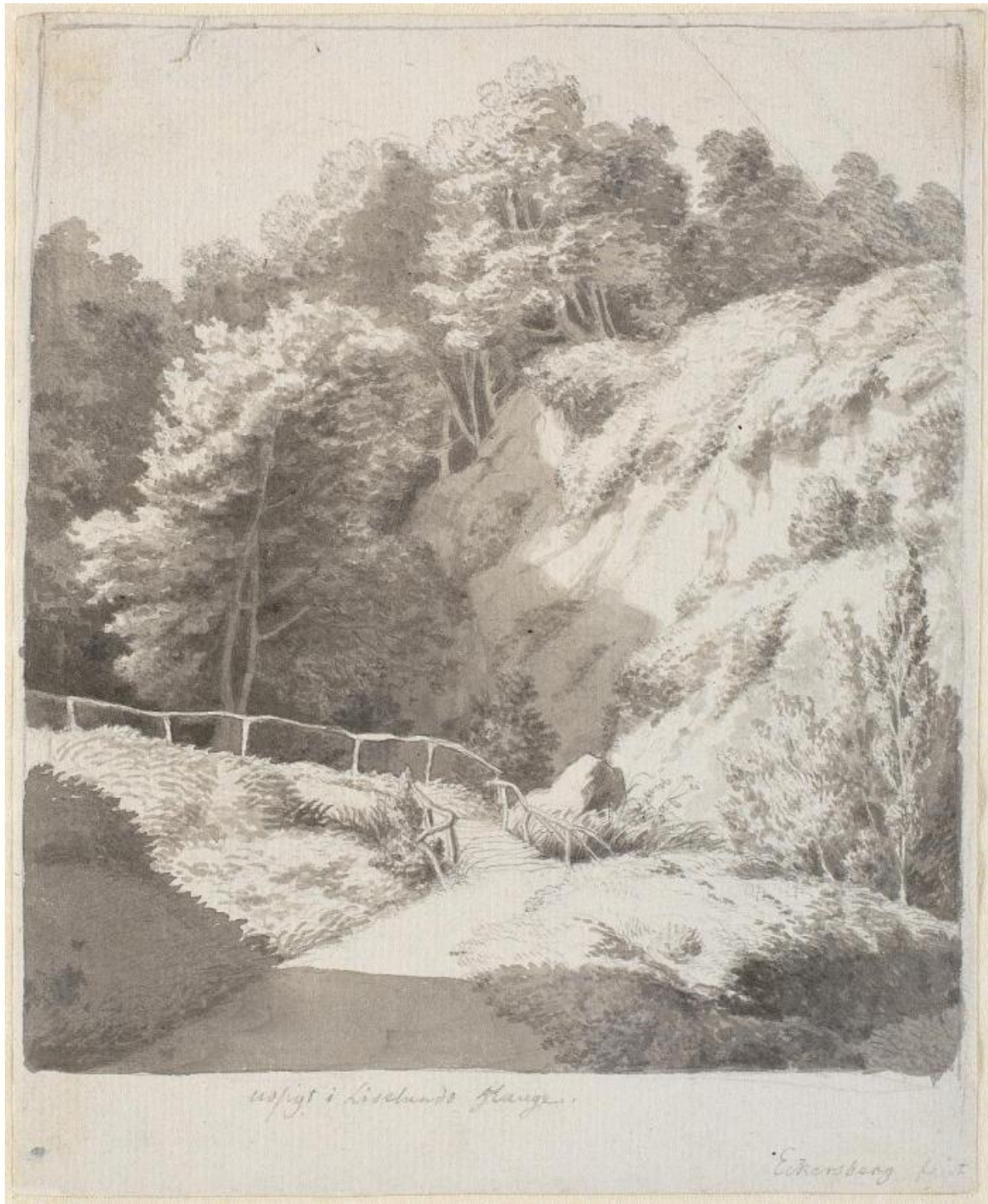
Fig. 2. C.W. Eckersberg: View from the gardens of Liselund . Circa 1809. Pencil, pen and ink and wash. 191 x 155 mm. The Royal Collection of Graphic Art, KKSgb4042. Bought for the Royal Danish Academy of Fine Arts at the estate sale of Johan Bülow in 1829; transferred to The Royal Collection of Graphic Art in 1845. public domain , SMK .

With the library director's proposal and the librarian's initial blessing, the Academy now spied a major endowment of art on the horizon – although there was a clear risk that it might have to be paid for. It is unlikely that the academy assembly would allow this opportunity to slip away, and it would appear that work was being done behind the scenes in order to promote such a transfer. Presumably seeking to build up arguments why the royal collections of art on paper should be reallocated to the Royal Danish Academy of Fine Arts' library, the Academy now embarked on a