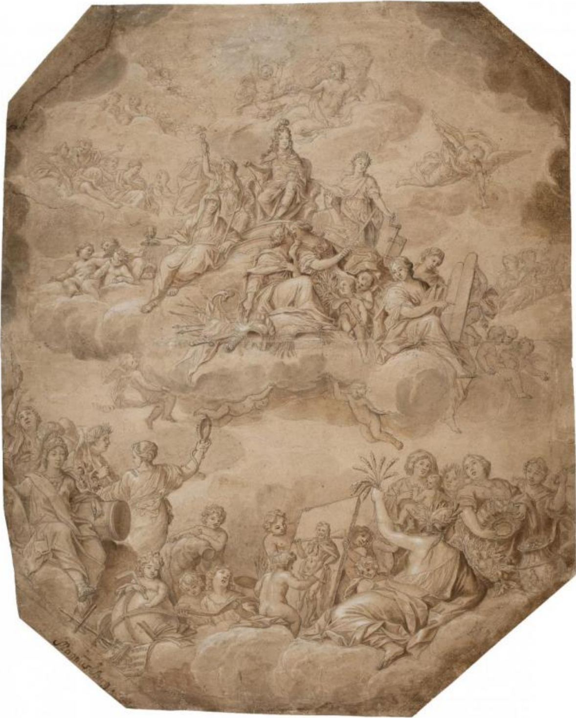
Fig. 7. Magnus Berg: The Apotheosis of Christian V . Pen and black ink, brown wash, white highlights. 639 x 515 mm. The Royal Collection of Graphic Art, KKSgb8759. Acquired as part of J.C. Spengler's collection in 1840.

Spengler's collection of Danish drawings comprised more than 1,700 sheets and was arranged to provide an historic overview of almost three hundred years of drawing, from Melchior Lorck [e.g. fig. 6] to C.W. Eckersberg. 26 The collection is not only distinguished by its extent, but also by its high quality overall and by its representative selection of eighteenth-century art in particular. Especially striking were the collection's many large-scale sheets, such as Jacob Coning's scene from the gardens behind Charlottenborg, Magnus Berg's Apotheosis of Christian V [fig. 7] or Peder Als's