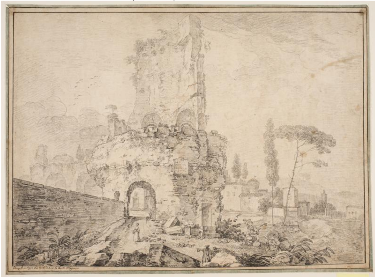
Fig. 4. J.P. Lund: Landscape with ruins outside of Rome . 1764. Pencil and black chalk. 430 x 581 mm. The Royal Collection of Graphic Art, KKSgb8698. Bought for the Royal Danish Academy of Fine Arts at the estate sale of J.F. Clemens in 1832; transferred to The Royal Collection of Graphic Art in 1845. Statens Museum for Kunst, public domain , SMK .

scientific collections. Thomsen's ideas were taken on board in the final proposal that Hauch presented to the king, Frederik VI, in March of 1831, and in April the final decision was reached: the collection of drawings was to be separated out from the Royal Library. 21 While this meant that the idea of transferring the collections to the Royal Danish Academy of Fine Arts had been shelved, the Academy could still reasonably regard itself as a potential candidate for having the nation's primary collection of Danish drawings. As a result, the Academy continued to purchase Danish drawings for a while yet. For example, at the auction of the estate after the engraver Johan Friedrich Clemens on 1 May 1832, the Academy acquired a group of excellent drawings by Jens Petersen Lund, Abildgaard, Clemens, Juel and others. 22 [figs. 3-4] However, before the decade had come to an end, the Academy had also been outmanoeuvred by the competition on this score.